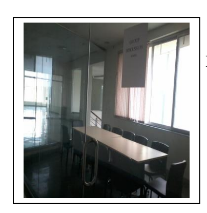
Page 25 of 59